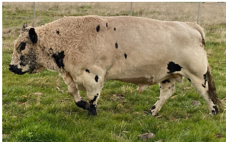
Vale Hill Farm Biscotti: 16/05/2016