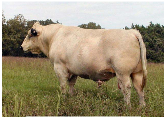
JWest's W.W. Doc DOB: 29/08/2004